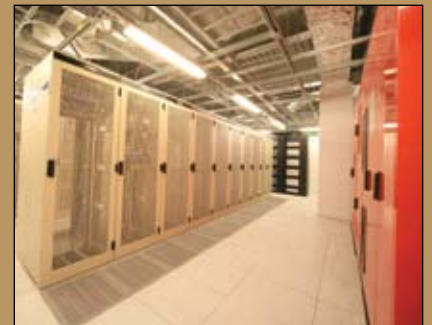
An example of vinyl-finish flooring now being produced under the new process.

In addition to short lead times and consistently high quality finishes, the new line has considerably reduced waste – which once again meets Kingspan's desire to halve landfill.