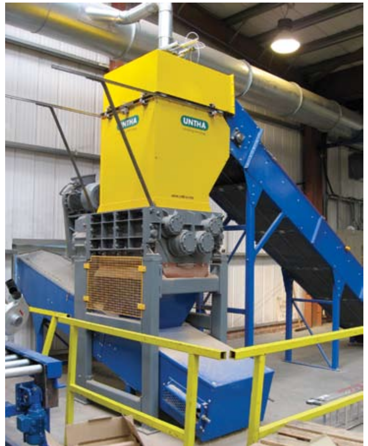
The Kingspan recycling shredder at the company's Hull site.

As well as recycling off-cuts, Kingspan is sometimes also asked to recycle earlier generations of its raised flooring as part of orders to provide new, replacement product. Such a contract is currently being carried out at the One Canada Place complex at Canary Wharf.