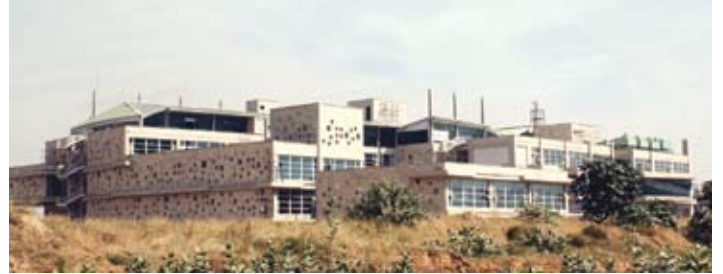
ABOVE: The Agilent Technologies campus in India.

Kingspan Access Flooring’s international operations cover Europe, the Middle East and the Far East. Last year was