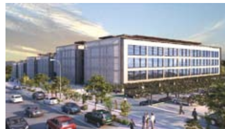
LEFT: Tripark Las Rozas in Spain.

one of the company’s best ever for sales, with green projects making significant contributions. For example in the largest job ever undertaken by Kingspan in India, the company supplied 22,000 sq m of RLG 600 flooring to Agilent Technologies Ltd for a state-of-the-art campus near Delhi.